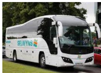
Coaches for trips