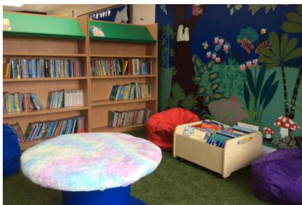
Whole new Library