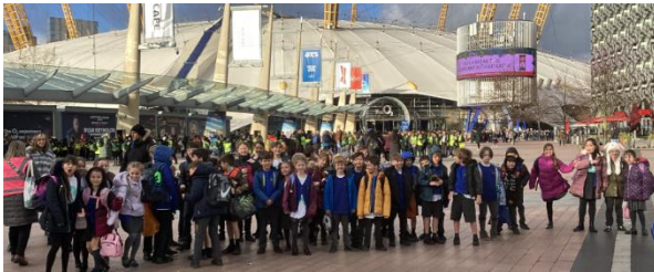
KS2 Young Voices Trip