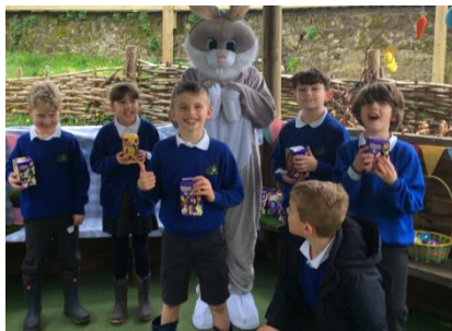
Easter Egg Hunt