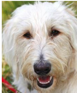
Flo the reading dog