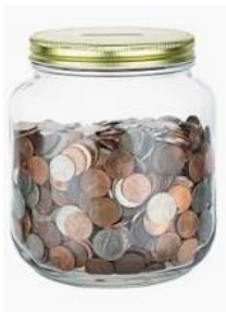
Coins in a jar