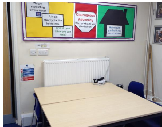
Outside the library