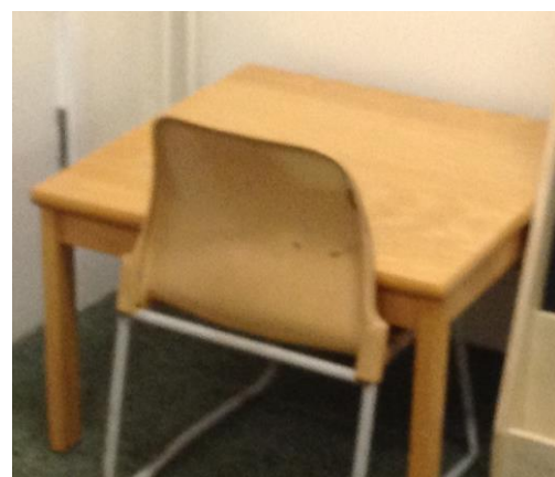
A workspace within a classroom