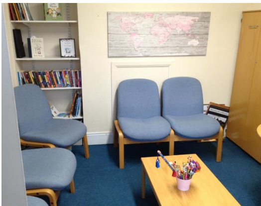
The Head Teacher's Office

There are various safe spaces within classrooms and in the wider school: