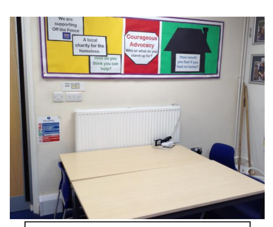
Outside the library