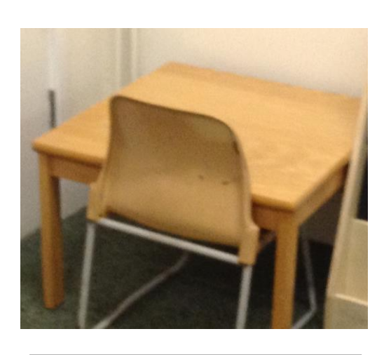
A workspace within a classroom