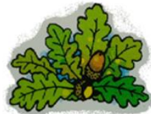
Be the Best You Can, Guided by God

We have four Christian values that guide us and help us to achieve our vision.