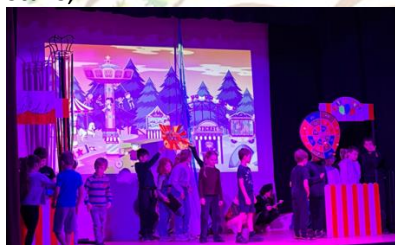
Beech's ghostbusters and Silver Birch class telling the traditional tale with aplomb!